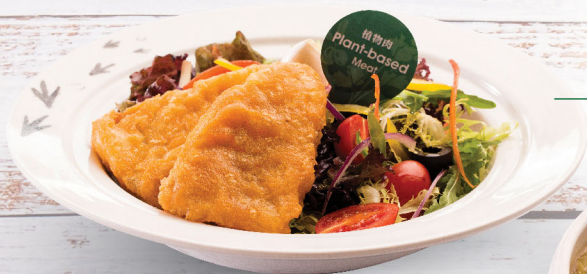
炸植物魚塊配田園沙律 gardein Garden Green Salad with Deep-fried Fishless Fillet

植物魚塊、沙律菜、車厘茄及素沙律醬 Fishless Fillet, Green Salad, Cherry Tomato and Dairy-free Mayonnaise